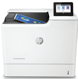
HP Color LaserJet Enterprise M653dn

This HP Colour LaserJet Printer with JetIntelligence combines exceptional performance and energy efficiency with professional-quality documents right when you need them – all while protecting your network with the HP's deepest security. 1