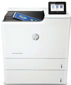
HP Color LaserJet Enterprise M653x